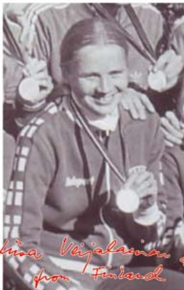
Liisa Veijalainen from Finland

Welcome to the 2008 British Orienteering Championships in Culbin Forest, Moray. It is now 31 years since the first use of Culbin - for the 1976 World Championships Relay (see comments from Liisa Veijalainen, World Champion from 1976). It is a wonderful sand-dune forest with highly detailed blocks of terrain mixed with flatter "slacks" and with very little undergrowth to slow running down. The individual race will use the newly mapped eastern end of the forest almost exclusively (7km2 of runnable forest) and the relay will use part of the old 1976 map - remapped for last summer's 6-Day event. Planners comments are "fantastically runnable and relentlessly technical, the best new all-round orienteering area since Docharn & Deishar"