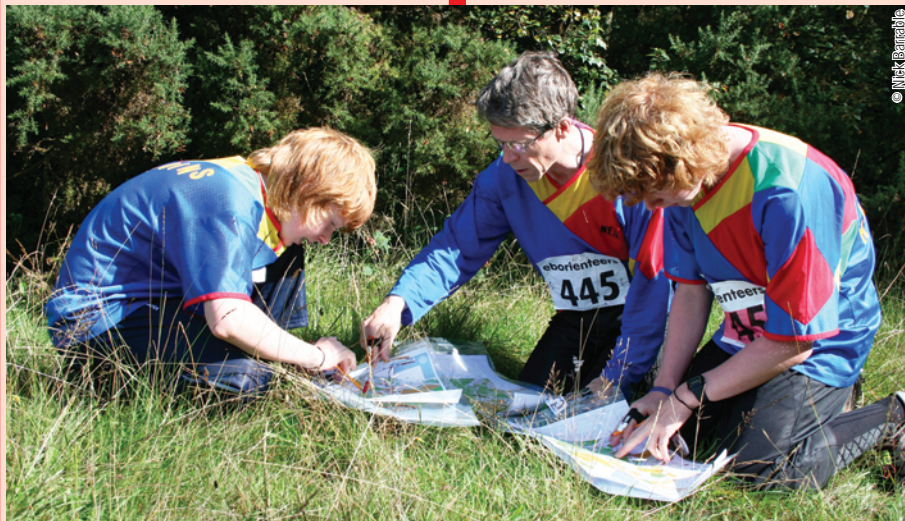
A Harlequins team plan their route.

The 36 th edition of the White Rose is in Newtondale next year - one of our most technical areas (JK in the 80s).